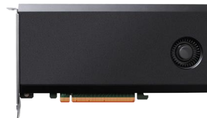
Dedicated PCIe 3.0 x16